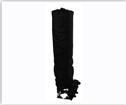
1. Remove from bag