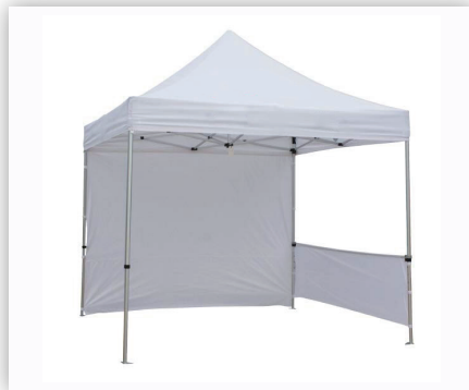
17. Halfwall assembled