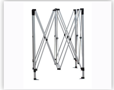
3. Extend frame to extended size of 4' x 4'