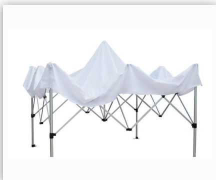
7. Lift inside pole in center to extend frame completely