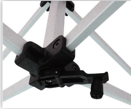
11. Spin winder in the center of the frame to completely tighten tent