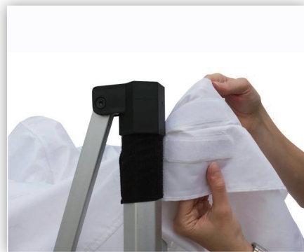
5. Align the canopy top over the frame corners and place Velcro on all 4 corners (none on top piece)