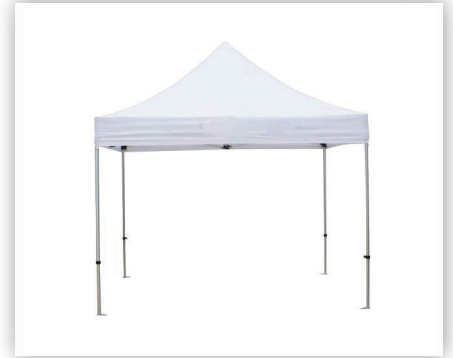
12. Canopy kit assembled