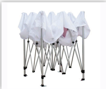
4. Lay canopy over top of frame