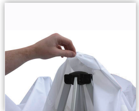
6. Make sure canopy is flush on hardware