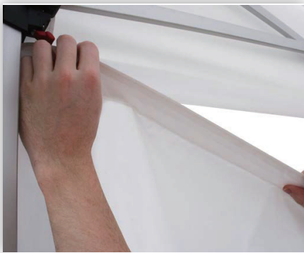
13. Apply full-wall to top Velcro strip inside canopy