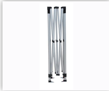
2. Place feet on stable ground