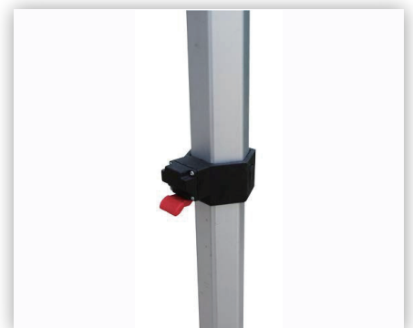
9. Lift the 2 adjacent outer legs and slide out the inner legs until the snap button locks into the hole in the outer leg