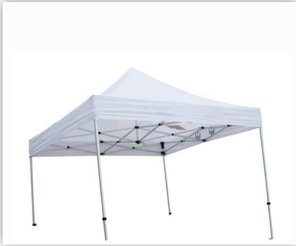
10. Repeat on opposite legs; Make sure to do two legs at a time. *Minimum of two people recommended.