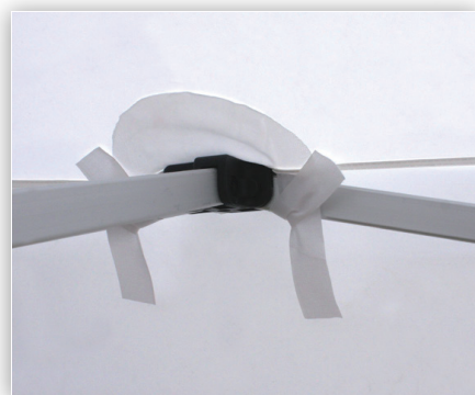
8. Secure top with tabs