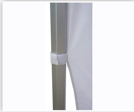
14. Secure to side poles with Velcro strips